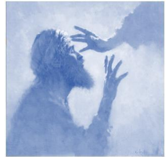
Healing of Bartimaeus

EDMONTON, ALBERTA AT THE FAIRMONT HOTEL McDONALD JUNE 9-11, 2017